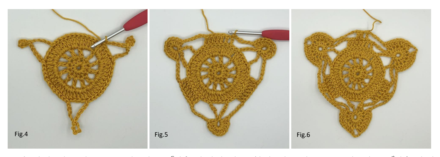
Round 4: sl st loosely into the next 12 sts, ch10, slt st in 5<sup>th</sup> ch from hook, ch5; sk 3sts; (sl st loosely into the next 13 sts, ch10, slt st in 5<sup>th</sup> ch from hook, ch5; sk last 3 sts) repeat 2 times; sl st in last sl st join of prev rnd round. (fig.4) You should have 3 x 13 sl st sections & 3 x ch5 "corner loops".

Round 5 : sl st loosely into next 3 sts, you can sl st into the dc of Round 3 as the loops for these are running along the top of the circular section of the motif (see video if you are unsure), ch 3 (counts as 1<sup>st</sup> dc), 1dc into each of the next 6 sts; (ch6, 12 hdc in ch5 loop, ch6; sk3 sts, 1dc into each of the next 7 sts) 2 times; ch6, 12 hdc in ch5 loop, ch6; join with sl st in 3<sup>rd</sup> ch of ch3. (fig.5) You should have 3 x 7dc, 6 x ch6 space & 3 x 12hdc corners.