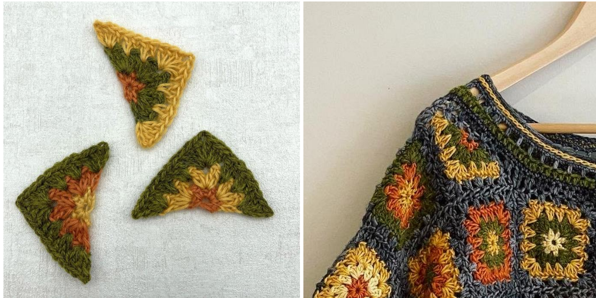
A crochet pattern by Merrian Holland