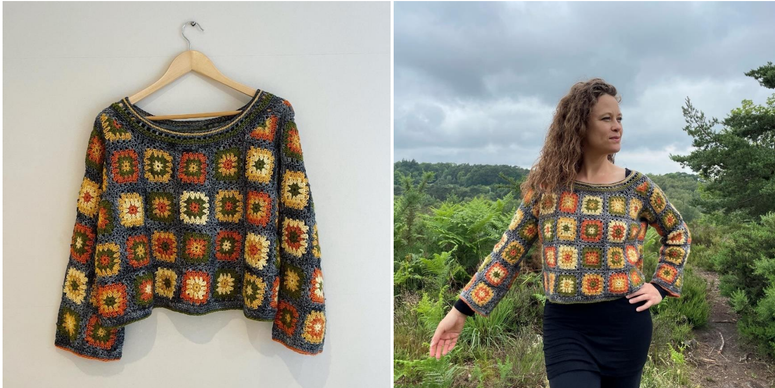
A crochet design by Merrian Holland