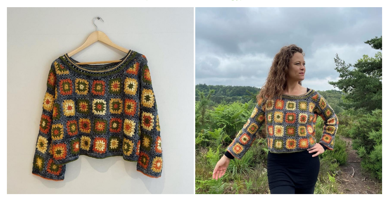
A crochet design by Merrian Holland