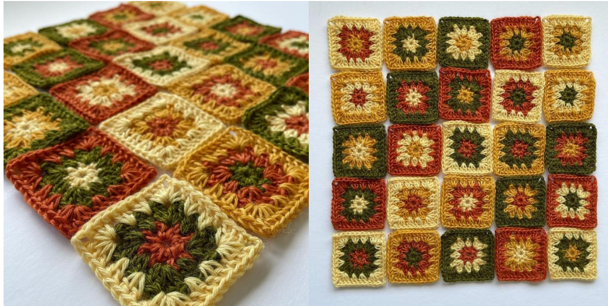
A crochet pattern by Merrian Holland